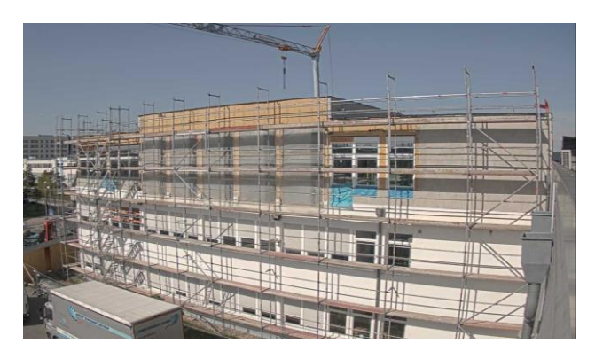
Photo: Always up to date with our construction webcam.: www.ontour-fra.de.

We are already looking forward to the inauguration, which is planned for summer 2022. Follow the progress of our construction live via our webcam at www.ontour-fra.de.