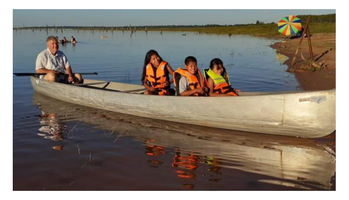
Photo left: The happy faces reveal, that the canoe fully serves its purpose and that the recipients in Asuncion are very happy about this cargo.

In the opposite direction, some stowaway takes advantage of the crossing to us in Germany, like this exotic butterfly that came by a container from overseas.