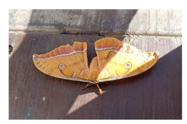
Photo right: Our Hamburg colleagues found this unusual stowaway while unloading a container from overseas.

In a nutshell: *** ontour airfreight division optimistic: Demand for airfreight capacities significantly above pre-crisis level. However, capacity bottlenecks still expected due to lack of intercontinental flights until 2025. *** ontour sea freight: Conditions remain challenging due to high rates, persistent bottlenecks and waiting times. Early planning and booking of free container slots therefore essential. *** ontour UK line: Demand for UK transports continues to boom, customs clearance is perfectly coordinated. *** ontour E-Commerce: One million returns mark exceeded. *** ontour goes Berlin: We are now represented by another branch in the German capital. ***