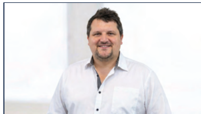
- Managing Directors UK -